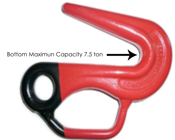
TYPICAL SORTING HOOK

VIEW SAFETY LIFTING LUG ONLINE: WWW.PIPEMASTEROILFIELD.CA